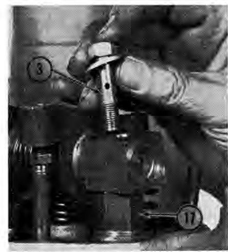
Fig. C5397-Insufficient oil flow to the non-diesel and diesel series 550 and 570 rocker arms can be caused by foreign matter in hollow stud (17) and/or screw (3).

To remove the tappets, it is necessary to remove the camshaft as out-