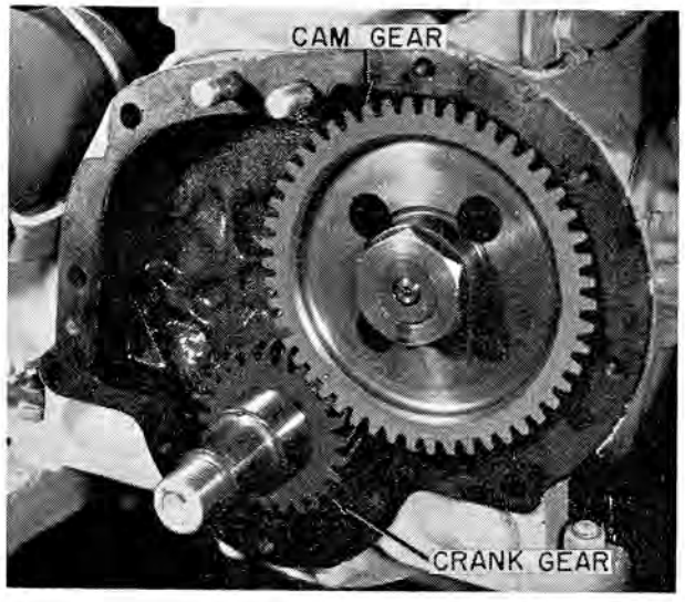
Fig. CS402—Timing gear train on diesel series 550 and 570 equipped with a Bosch injection pump.

Fig. CS401—Timing gear train on diesel series 550 and 570 equipped with a Roosa Master injection pump.