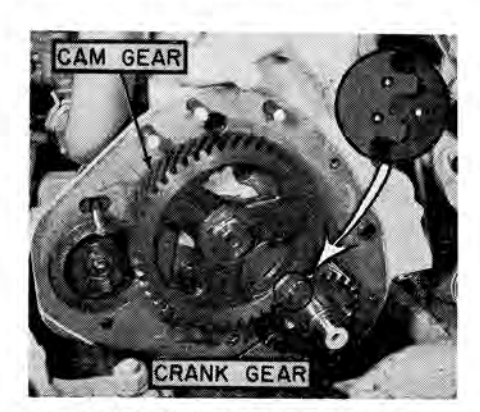
Fig. C5399—Series 540 timing gear train, showing gears meshed with valve timing marks in register.

55. On series 560, valves are properly timed when all timing marks are in register as shown in Fig. CS403. Chisel marked line on camshaft must register with similar mark on camshaft gear hub. Chisel marked tooth on camshaft gear must mesh with chisel marked tooth space on idler gear and chisel marked tooth on crankshaft gear must mesh with chisel marked tooth space on idler gear.